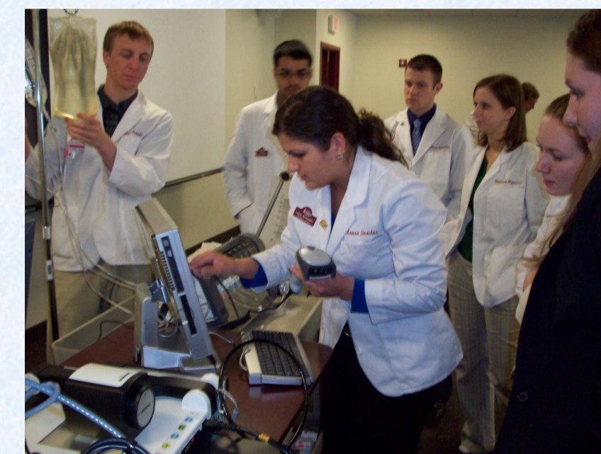
Figure 2. Students were given a demonstration on the use of an automated compounder to prepare a TPN product, an example of medium risk level products.