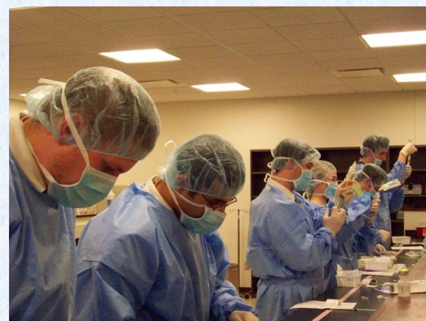
Figure 3. Students preparing products in the main teaching lab. The bench was taped at 6-inch from the edge to mimic the horizontal laminar flow hood.