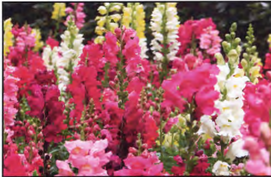
IN BLOOM Brad Hartstein