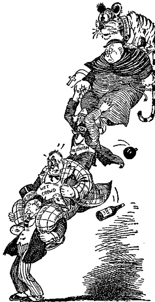
This much-used cartoon piles up many objections to Smith's candidacy, among which the symbol of his religion is the only one left unlabeled.