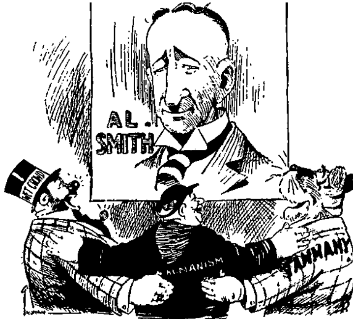
One of the Klan cartoons of 1928