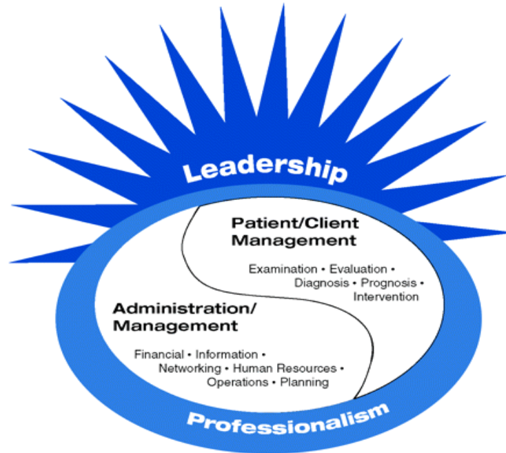
Figure 1.1. Adapted from conceptualization of LAMP model integrated with patient/client management model. (Schafer et al., 2007, p. 262).

In 2007, Schafer et al. conducted a survey with 435 physical therapists, representative of the field of practicing clinicians and academicians across the United States. Participants in the study reviewed 121 FINHOP skills and scored the items on Likert scales for skill and knowledge (Schafer et al., 2007). The higher the score, the greater independence required upon graduation for entry level application of knowledge and/or skill. This survey's results indicated that more independence is needed when negotiating FINHOP categories of human resource management, information management, and operations skills than is necessary when developing skills for networking, planning/forecasting, and finance (Schafer et al., 2007).