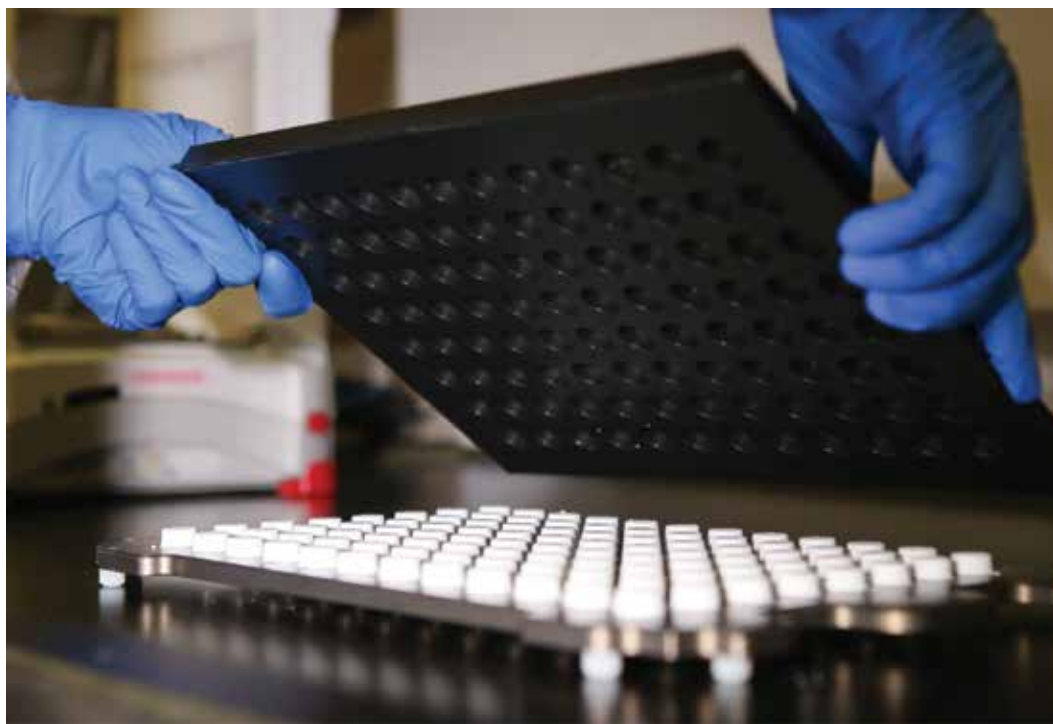
FIGURE 2. APPEARANCE OF RAPID-DISSOLVING TABLETS AFTER THEY ARE RELEASED FROM THE MOLD.

This pilot study was designed to evaluate the chemical and physical stability of a representative DHEA RDT formulation immediately after preparation and over six months of storage. Such information will aid the compounding pharmacists in establishing proper storage conditions and beyond-use dates of similar DHEA RDT preparations.