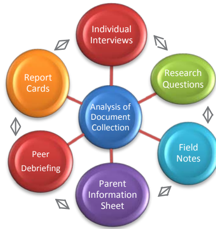
Figure 3.1. Triangulation of the data.